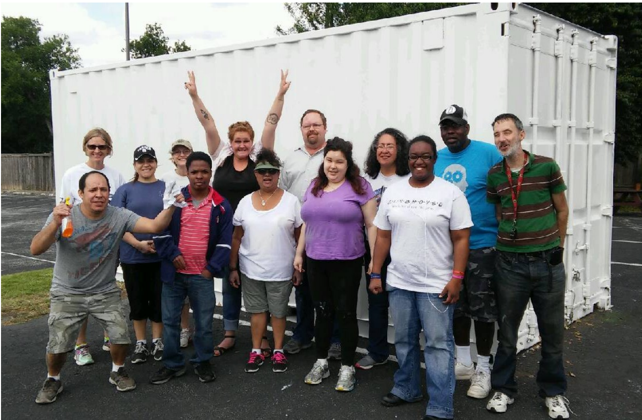
This is the group who painted the storage pod at San Antonio Clubhouse on April 8. Looks like a fun group!

Our annual congregational meeting will be held Sunday, June 11, following the 9:30 a.m. worship service. In that meeting, we will hear reports on our ministries, vote on proposed changes to our constitution that will bring it into alignment with the ELCA Model Constitution, elect Parish Council members, and adopt the budget for next year. All members are encouraged to participate and to lend your voice and vote.